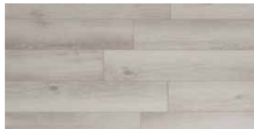
Snow Dome SPC-100-739XL-03