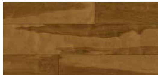
Brazilian Cherry SPC-102-CDW732L-08