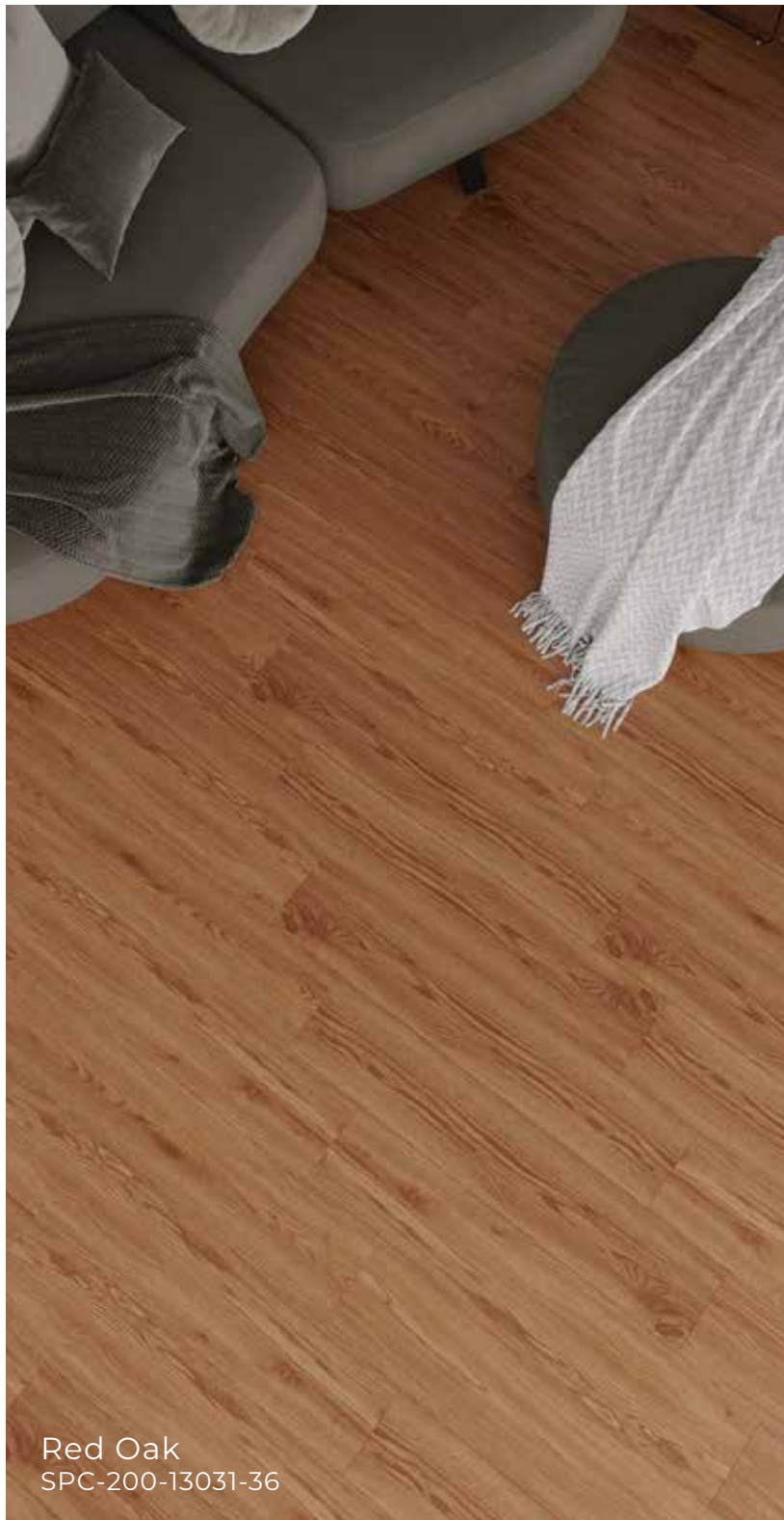
Red Oak SPC-200-13031-36